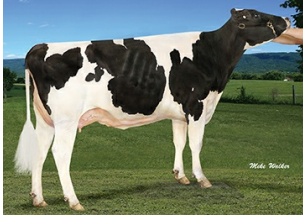
MGD Ar-Joy CU Drast Apple-ET

Sire: S-S-I MAXIMUS PLAYOFF-P-ET Dam: AR-JOY CU PARI ALYSSA-ET MGS: SIEMERS RENGD PERFECT-ET