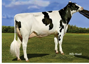
MGGD Guided-Path Jedi Aruba